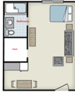
Charleston House Memory Care Studio (380 sq. ft.)