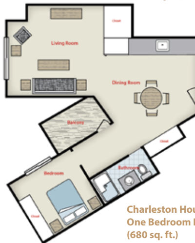
Charleston House One Bedroom Deluxe (680 sq. ft.)