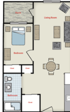
Charleston House One Bedroom (580 sq. ft.)